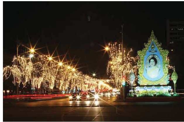
Street decoration in Bangkok at HM the Queen's Birthday

During the first three evenings, we will invite you to different Thai restaurants and eateries in order to make you familiar with Thai dishes. Nothing is more frustrating than standing hungry in front of a food stall but not knowing whether you could eat what you see there. You will taste Central, Northern and Southern Thai dishes and learn how to pronounce the names of those dishes you like best. Certainly, we will also introduce you to Isaan Food, the dishes from the Northeast of Thailand.