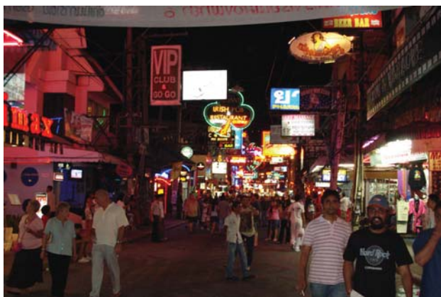
Pattaya at night

You can opt for some tanning sessions (take a good high-factor sun protection all the time!), enjoy a Thai Massage, rent a boat for a tour around the island, ride the banana or a jet-ski (all at your own expense). In this fine and white sand, playing beach ball or beach volleyball is sheer fun for those who need some tougher action.