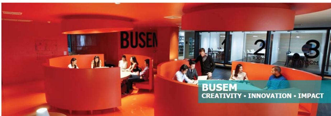
Here you will work during the Summer University: The Incubator at Bangkok University School of Entrepreneurship and Management (BUSEM)