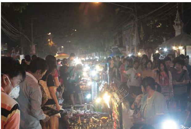
Chiang Mai Night Market

After the company visit, you will go back to Bangkok on a wooden boat along the shores of Chaophraya River, especially impressive when darkness falls.