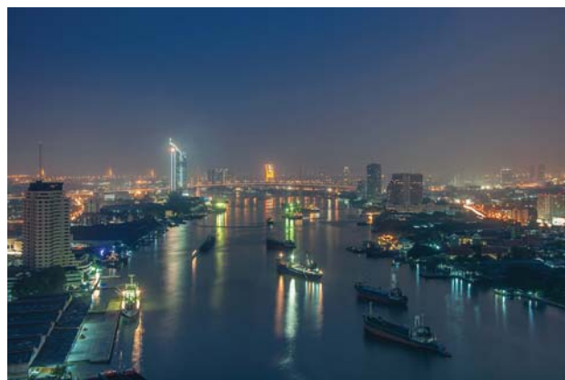
Chaophraya River, Bangkok

Our experience in organizing Summer Universities taught us, that our participants want some free time for shopping at the end of the program. Well, the conditions are great: We are in Bangkok, and there we have some of the best shopping centers in Asia. Enjoy!