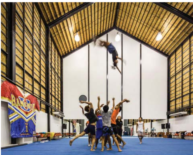
Cheerleader training at Bangkok University

Chiang Mai is on top of the wish list of almost every foreign visitor to Thailand, and so is Chiang Mai's Sunday Market. We fly to Chiang Mai in the morning, thus having time for a guided City Tour in the afternoon, before ending the day on the Sunday Market when the heat of the day is gone. The next day, you will get in touch with elephants big and small, and enjoy the most famous attraction that Northern Thailand has to offer: River Rafting.