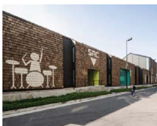
All images show Bangkok University

Learn through experience what Thailand can teach you, get inspired through a new and fresh perspective, turn inspiration into feasible business opportunities, and build your network for the future!