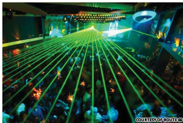
Bangkok, Route 66 Club

Karaoke meanwhile is as prominent in Europe as it is for decades now in Asia. If you wish to sing your soul out of your body, just let us know. The next karaoke bar is never far away in Thailand.