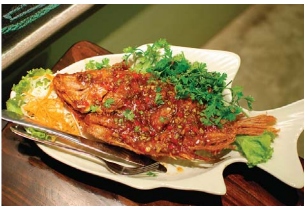
Pla Tod Sam Rod - a tasty Thai dish

In chronological order, we want to give you an overview of why some elements became integral part of this unique Summer University program.